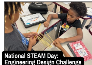
National STEAM Day: Engineering Design Challenge

During the month of November, we continued to have visits from our community partners. Our STEAM Ambassadors had their last playground design meeting with Trust for Public Land as well as community members. The students "collaborating strategically" as they planned the playground design for all of our Hope-Hill Eagles. We finished the month having 4-H complete a lesson with our 5th graders. We also had our social studies, science, and technology school fair. Stay tuned for our school winners! They will be posted in the next newsletter.